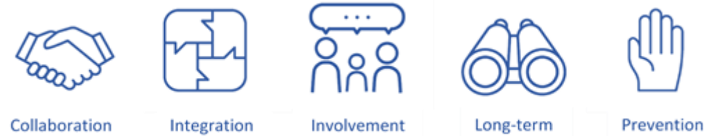
Figure 1: The 5 ways of working from the Well-being of Future Generations Act

Just as when we were preparing the Well-being Assessment, we have used the five ways of working, collaboration, integration, involvement, long term and prevention, to guide our work. This means that while considering how to improve well-being in our communities now, we've also looked at how well-being could be affected in the future and how we can prevent issues becoming worse. We will need to work together to see what we're each doing in a community and how this affects what we do, individually and in partnership. Finally, but most importantly, we want our communities, professionals, businesses and others to identify the issues which are most important to them.