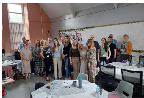
BG LWP Workshop at Rassau Resource Community Centre, July 2023

The workshops were well-attended by partners, who were keen to engage and provided valuable insight into local well-being priorities and opportunities for further partnership working. The evidence gathered alongside a data-led outcomes approach has enabled the LWP to start developing a local well-being action plan that aligns to the Marmot and regional well-being priorities.