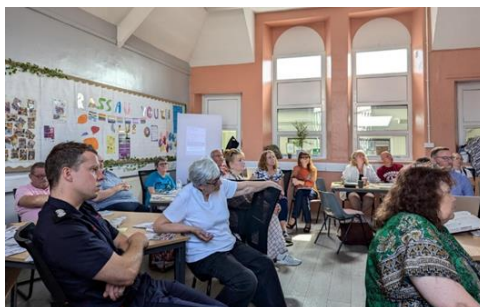
Blaenau Gwent 50+ Forum meeting at Rassau Resource Community Centre, July 2024