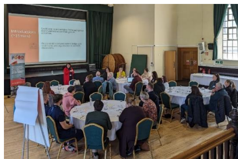
BG Food Partnership Community Food Support Network at the Llanhilleth Miners Institute, April 2024